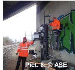
Pict. 8: © ASE