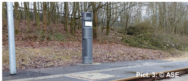
Pict. 3: © ASE