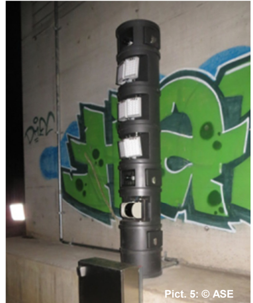
Pict. 5:

Duisport is currently frequented weekly by 30 freight trains from various destinations in China. Since the start of the routes in 2011, the port of Duisburg has been the start and destination of the China trains. As part of the Silk Road Campaign "One Belt, One Road", the transit times of Chinese freight trains are to be further reduced from 12-13 days. This is to be made possible, among other things, by automatic registration and digitization of the recognized vehicle and loading unit data using our video gates.