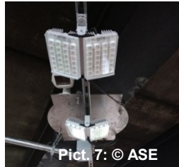
Pict. 7: © ASE