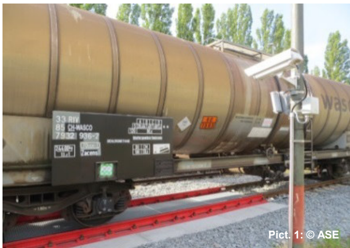
Pict. 1: © ASE

Thanks to NUMBERCheck, this works even with "short-coupled" wagons, which are usually made up of two "normal" wagons but are inseparably connected to each other and are regarded as individual wagons. The total weight of a wagon is determined by adding the associated wheel weights.