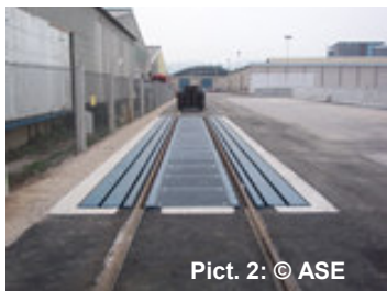
Pict. 2:

Picture 3+4: NUMBERCHECK detection sensors and GUI